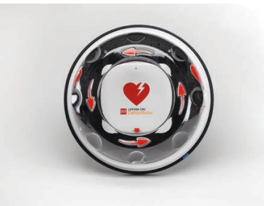
Rotaid Solid Plus Heat Wall Cabinet with Heat and Alarm For outdoor use.